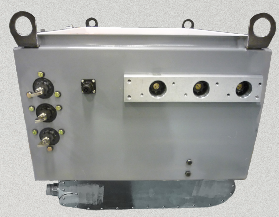
High power density

JDES developed this rapid prototype using a standard electrical cabinet and JDES technology. This project included electrical design to define and select the passive filter components, mechanical expertise for high power packaging and high power density water cooling, and production AC supply software inside the inverter.