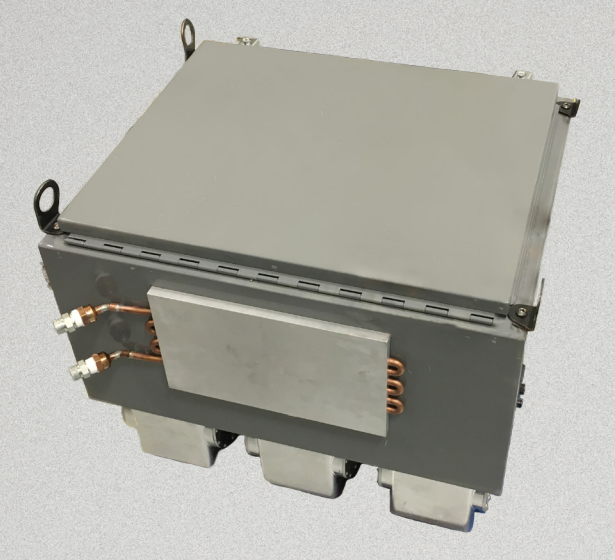
Liquid cooled AC Sine Wave Filter